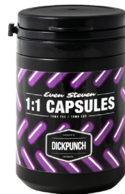
1:1 CAPSULES 15mg THC / 15mg CBD Contains: MCT oil, CBD isolate, THC Distillate.