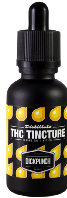
THC TINCTURE 1000mg THC Contains: MCT oil, THC Distillate.