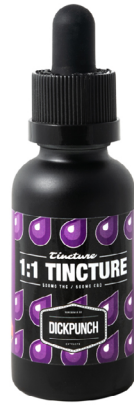
1:1 TINCTURE 500mg THC / 500mg CBD Contains: MCT oil, CBD isolate, THC Distillate.