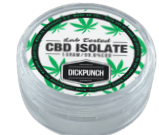
1g | 1000mg