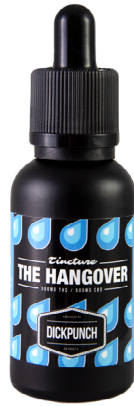
THE HANGOVER 500mg THC / 500mg CBD Contains: MCT oil, CBD isolate, THC Distillate.