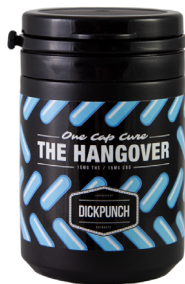
THE HANGOVER 15mg THC / 15mg CBD Contains: MCT oil, CBD isolate, THC Distillate.