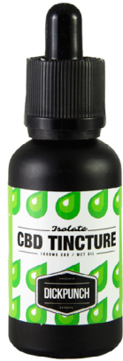
CBD TINCTURE 1000mg CBD Contains: MCT oil, CBD isolate.

Dickpunch tinctures are created using precision manufacturing techniques and the purest distillate resulting in a product that delights and satisfies without the unpleasant aftertastes. Dickpunch tinctures are lab tested and safe to use.