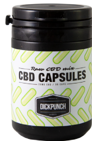
CBD CAPSULES 25mg CBD Contains: MCT oil, CBD isolate.

Capsules are designed with exact THC / CBD doses. Our process includes polishing and quality checks before packing. Every bottle comes with a tamper seal and moisture-absorbing silica pack to ensure freshness.