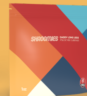
DADDY LONG LEGS