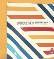
GREAT WHITE NORTH