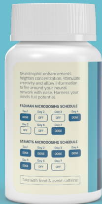
Dosing suggestion included on the back.